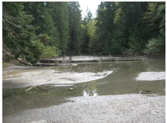
The forested shoreline along the estuary shoreline serves as an important source of LWD