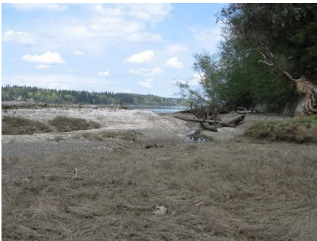
Salt marsh and baymouth spit at the entrance of the estuary.