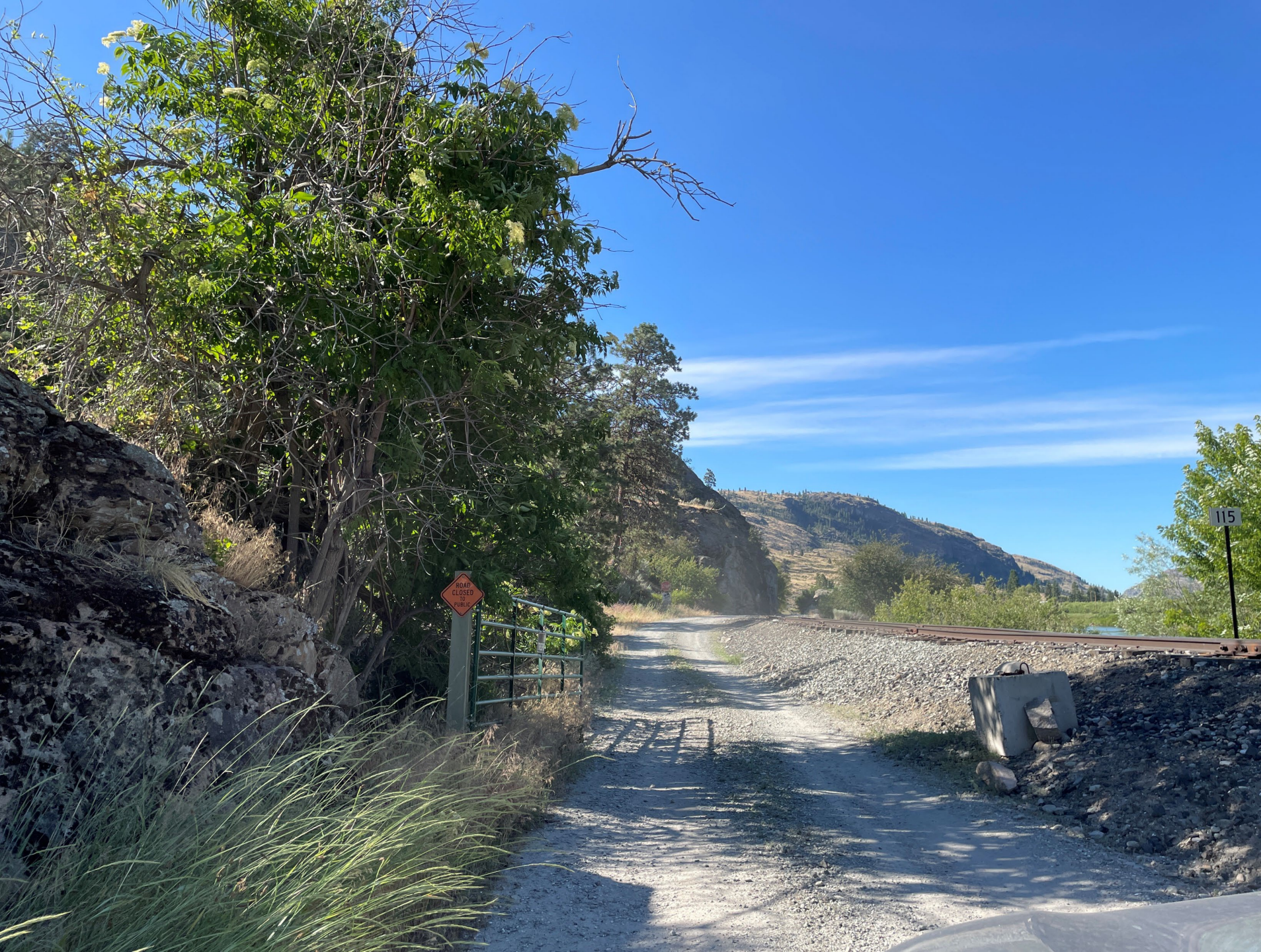
No public access from Keystone Rd, north of the project area