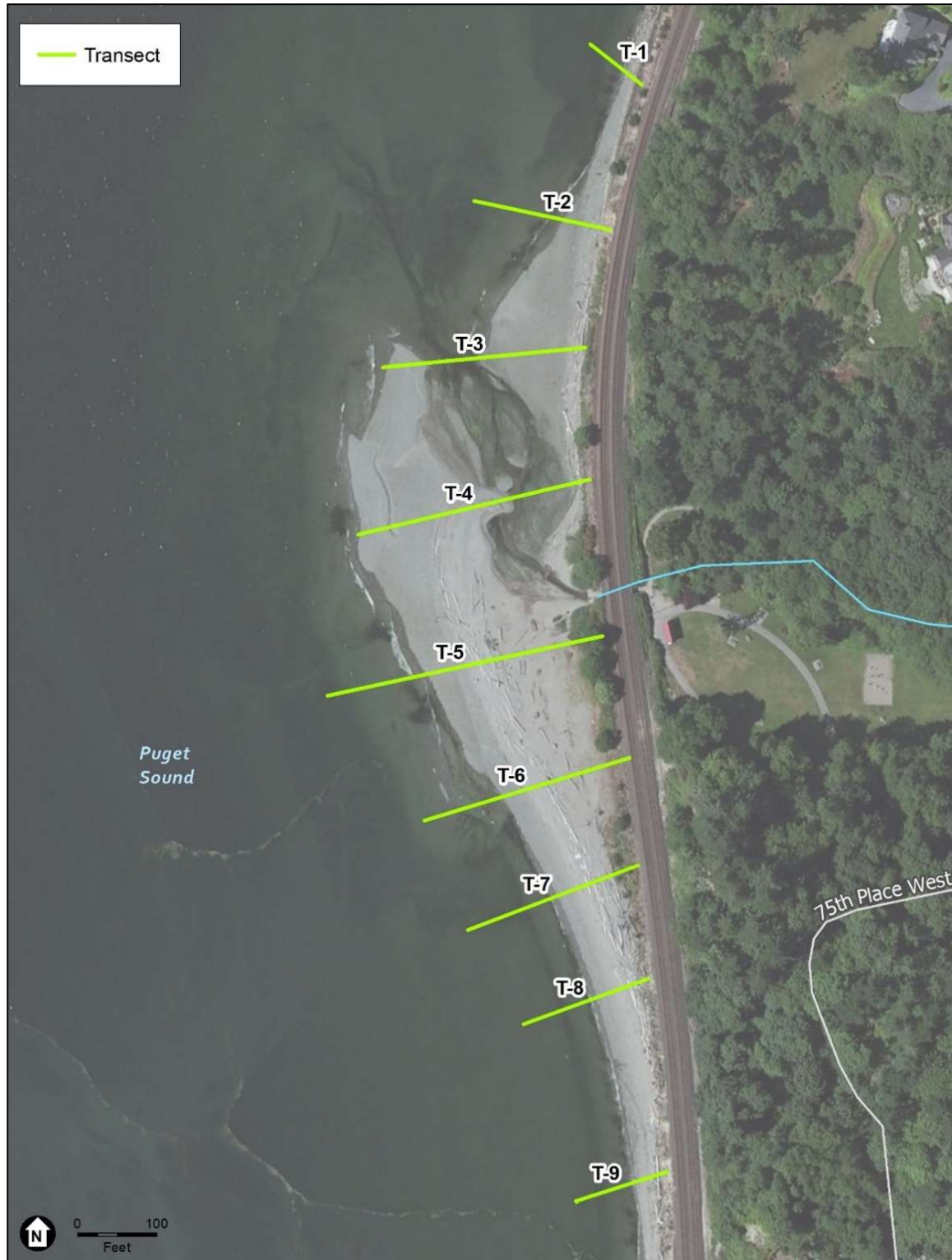
Figure 7. Lower Estuary Transect Locations