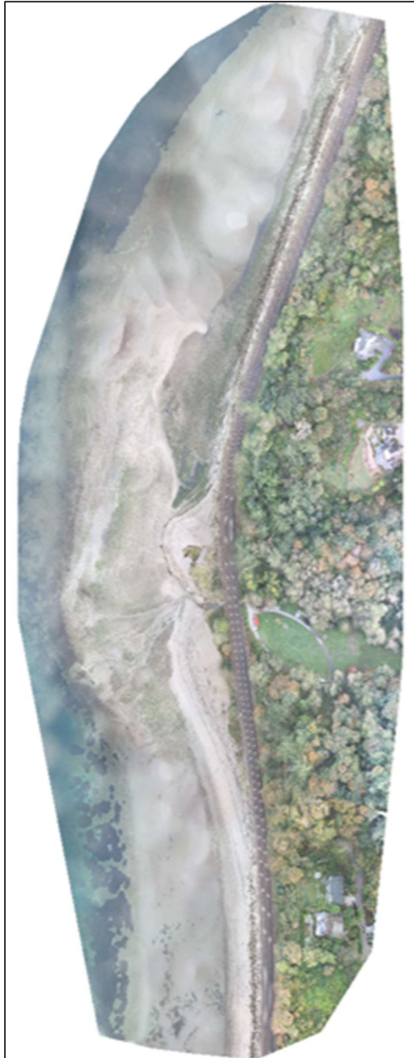
Figure 2. Target Drone Data Collection Area Extent