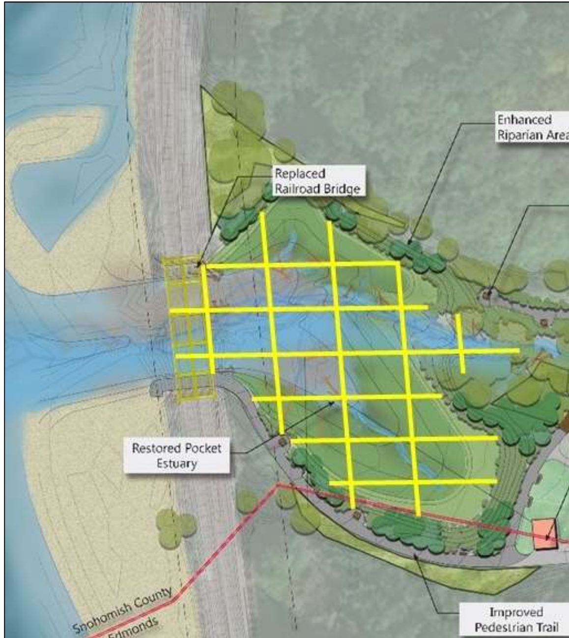
Figure 5. Recommended Creek Outlet and Upper Estuary Transect Locations