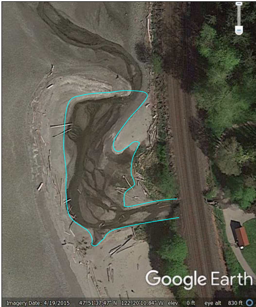
Figure 6. Example of Pocket Estuary Area of Interest (blue line)

Figure 6 shows the pocket estuary area of interest based on 2015 aerial imagery of the site. To inform how restoration of the stream mouth benefits both the lower estuary and adjacent nearshore areas (i.e., on-site and off-site locations).