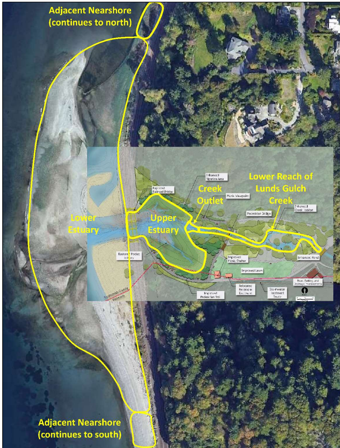
Figure 1. Monitoring Areas