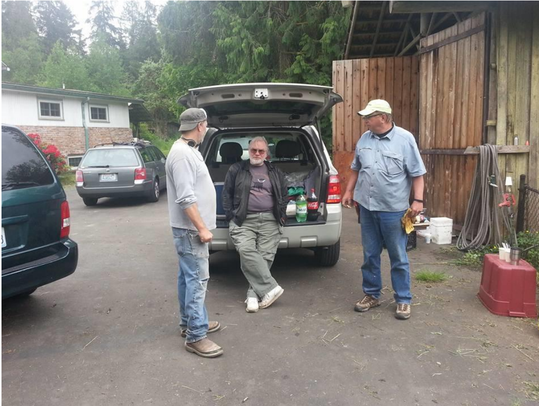
The farmer Frog team taking a lunch break at Paradise Farm 2015 May