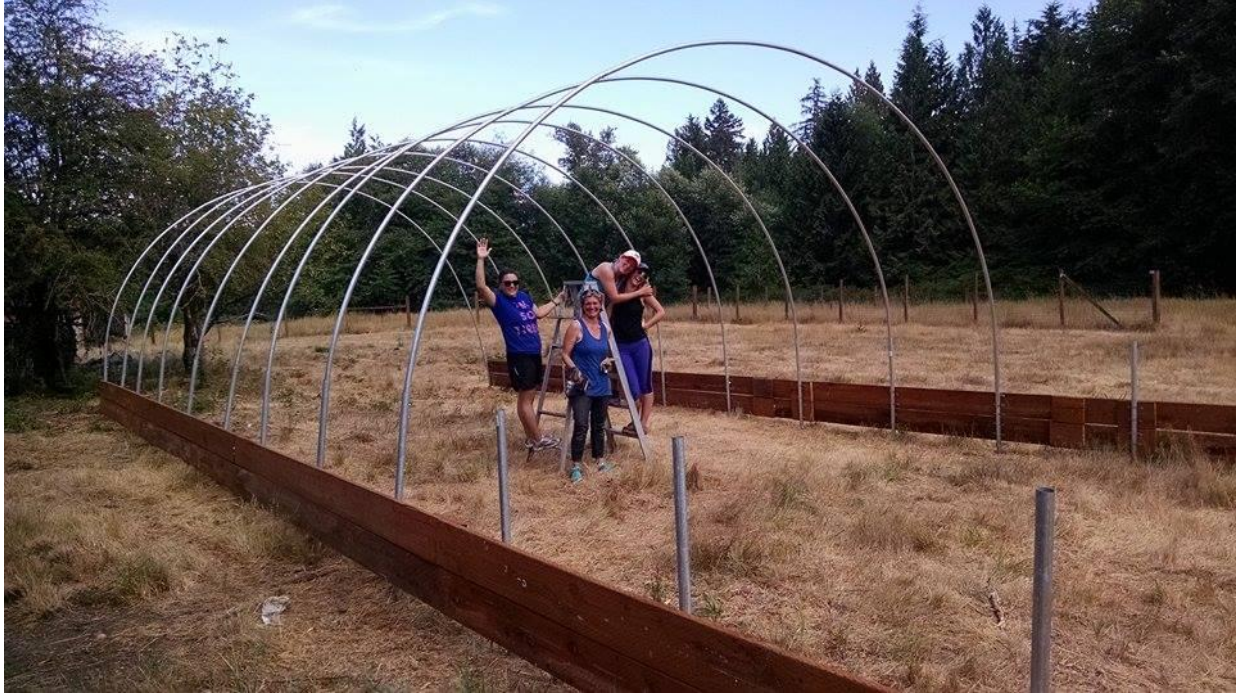
The first hoop house frame going up at Paradise Farm 2015 July