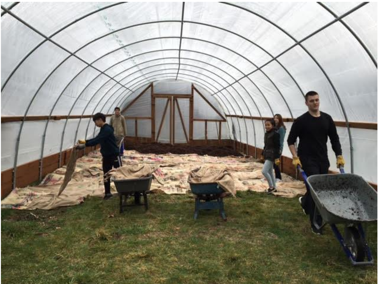
Finishing the first hoop house at Paradise Farm 2016 February