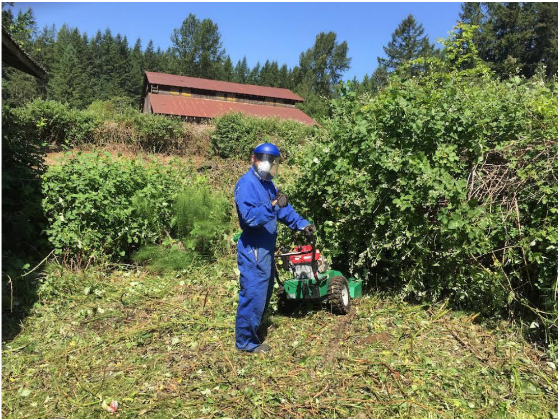
Cutting the blackberries Paradise Farm 2015 June