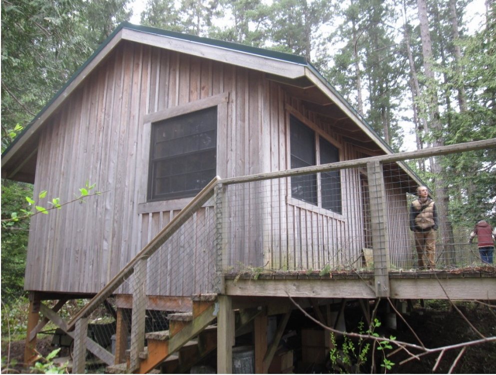
Cabin in Structures Area #1.