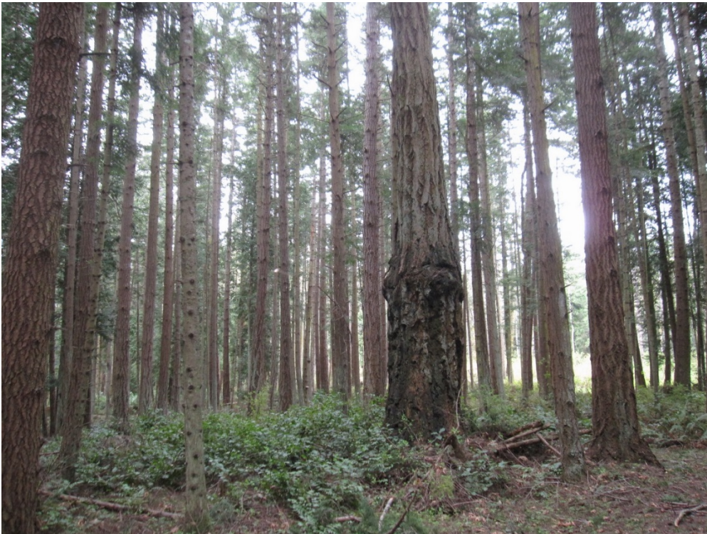
Old-growth Douglas-fir near center of property.