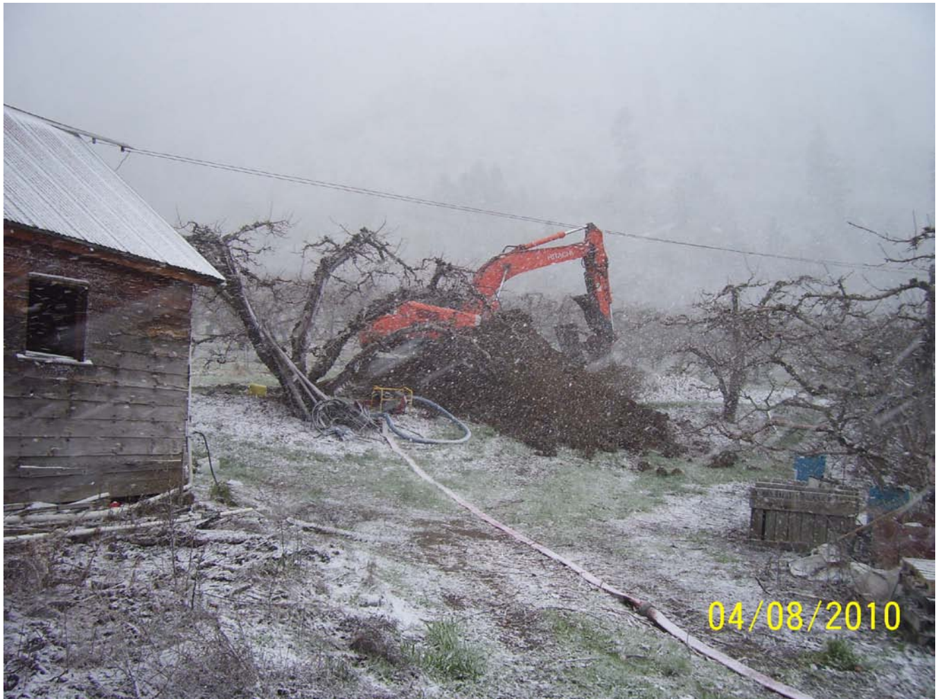
Work continues through unseasonable inclement weather.