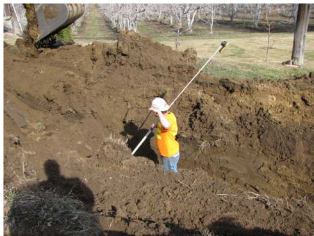
Mountain West controls excavation to sub-grade elevation.