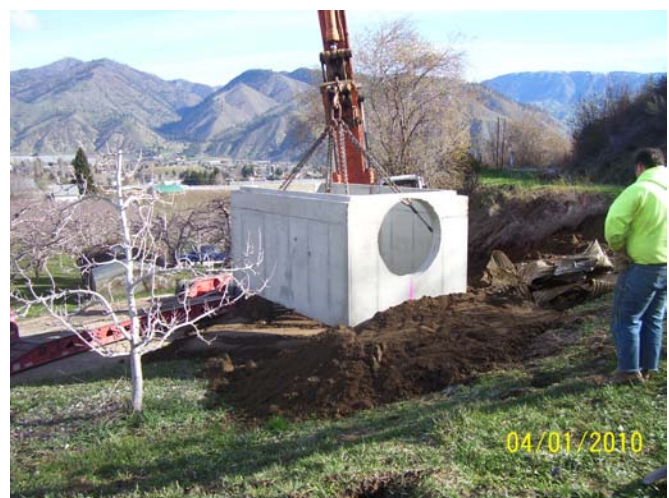
Delivery of flow control structure at Sta. 69+45.