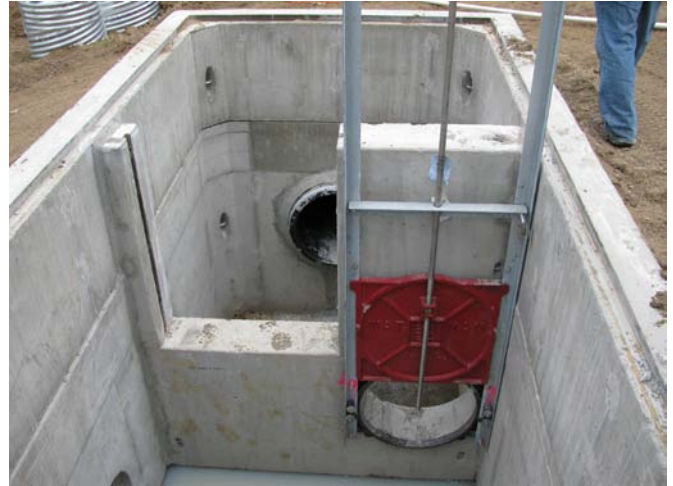
Connection of 36-inch pipe to flow control structure. Interior control gates installed.