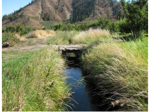
Existing canal conveyance system.