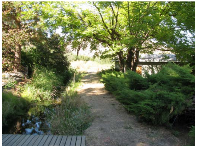
Pre-project required extensive landowner coordination.