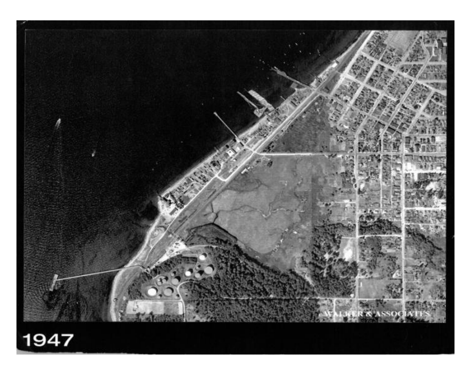
Image 3. Historic aerial of downtown Edmonds, WA showing 1947 extent of the marsh.