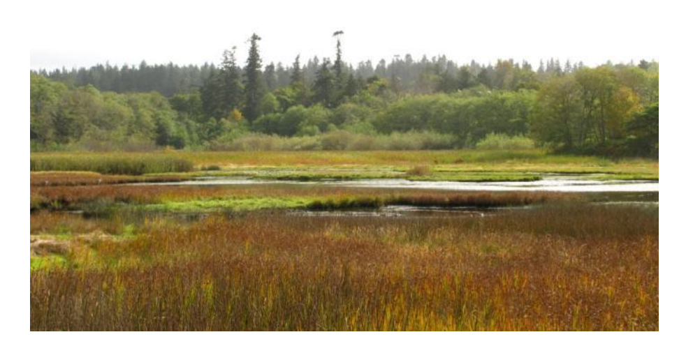
Image 2. View of Edmonds Marsh looking east from the viewing platform that borders the west side of the marsh. There are several Great Blue Herons in the marsh on the left side of the image. Photo: K. O'Connell, People For Puget Sound, 10/10/10.