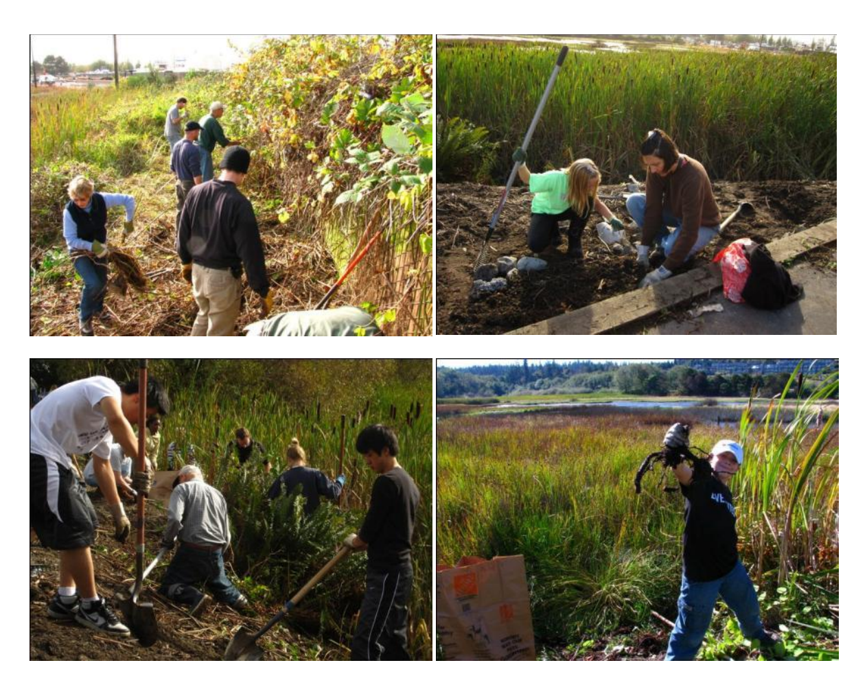
Image 5. Photos from recent Edmonds Marsh volunteer invasive species removal events.