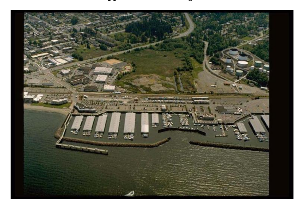
Image 1. Aerial view of Edmonds, WA showing Edmonds Marsh (center), Harbor Square (to the left of the marsh), Chevron property (to the right of the marsh- note: this image shows the oil tankers on the bluff top which have now been replaced by condos), and Port of Edmonds Marina (foreground).